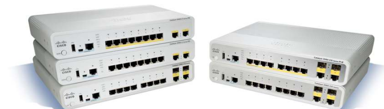
Figure 1. Cisco Catalyst 3560-C and 2960-C Series Compact Switches