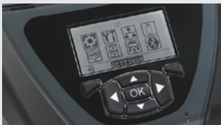
Easy-to-read display with larger, higher-resolution screen