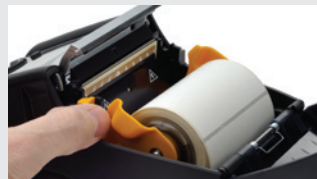
Intuitive peeler operation