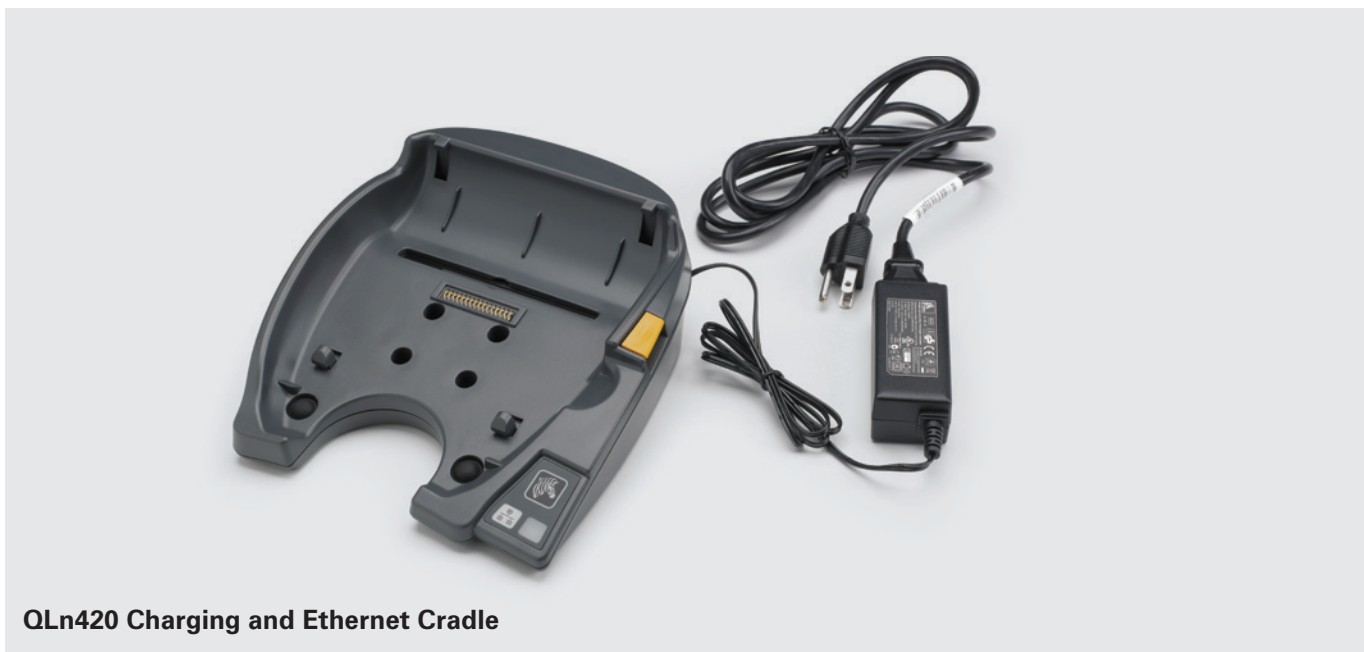
QLn420 Charging and Ethernet Cradle