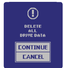
Rapid Secure Wipe Self-Destruct Mode (Optional)