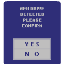
No Software or Drivers Mac, Linux and Windows Compatible