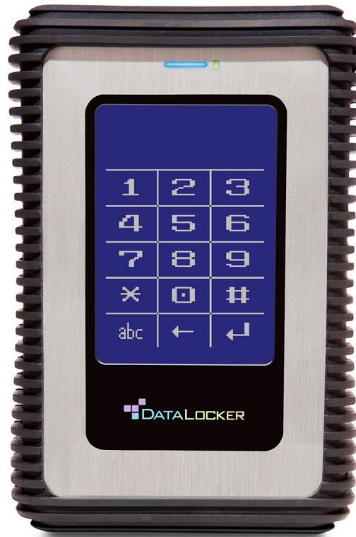
Two-Factor Authentication via RFID Card (available in some models)