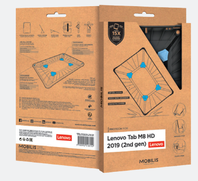
Available in polybag or packaging