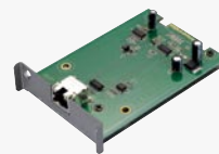
ACC-1000 KVM Cat.5 Console Module