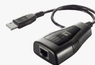
USB-0201 USB Gigabit Ethernet Adapter