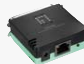
FPS-1031 Print Server with 1 Parallel