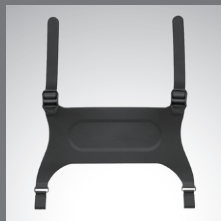
Rubber Hand Stap