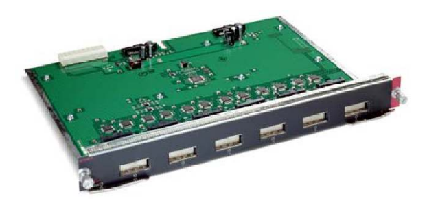
Figure 13. WS-X4306-GB Cisco Catalyst 4500 Gigabit Ethernet Module, 6 Ports (GBIC)