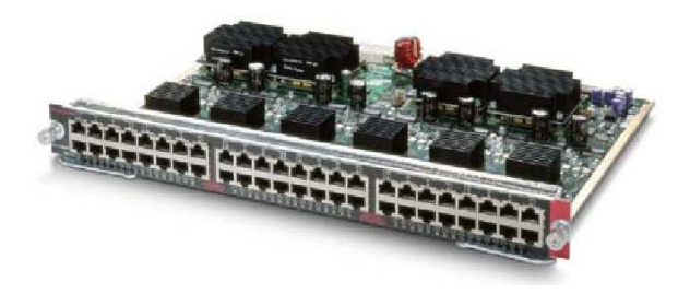
Figure 11. WS-X4548-GB-RJ45V Cisco Catalyst 4500 PoE IEEE 802.3af 10/100/1000, 48 Ports (RJ-45)