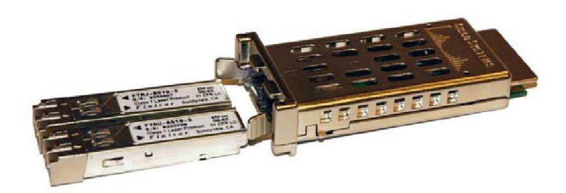
Figure 1. TwinGig Module

TwinGig modules convert a single X2 port into two Gigabit Ethernet SFP ports.