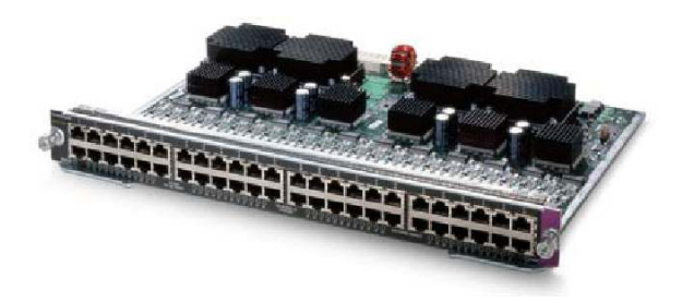
Figure 17. WS-X4248-RJ45V Cisco Catalyst 4500 PoE IEEE 802.3af 10/100, 48 Ports (RJ-45)