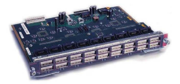
Figure 14. WS-X4418-GB Cisco Catalyst 4500 Gigabit Ethernet Module, Server Switching 18 Ports (GBIC)