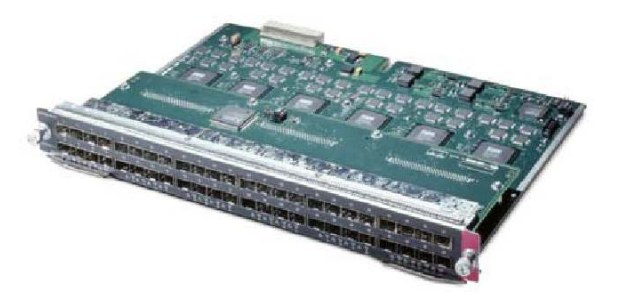
Figure 15. WS-X4448-GB-SFP Cisco Catalyst 4500 Gigabit Ethernet Module, 48 Ports 1000X (SFP)