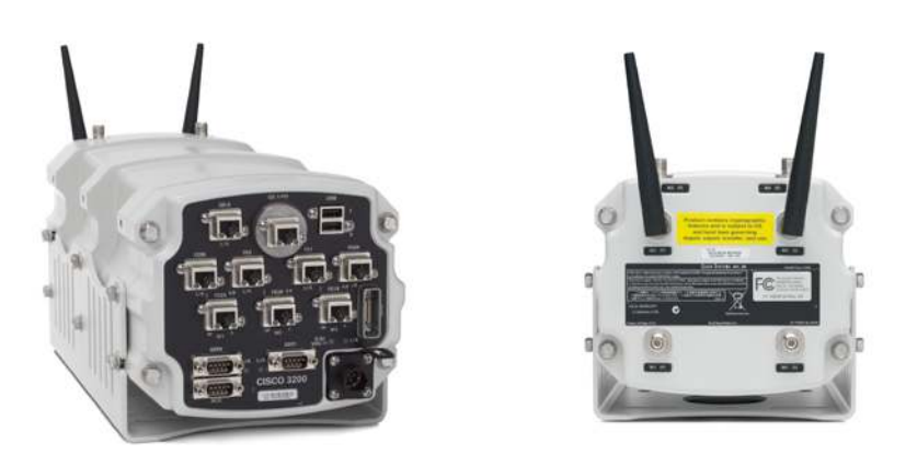
Table 2 outlines the preconfigured bundles you can order in the fully assembled Cisco 3200 rugged enclosure. You can insert spare mobile interface cards (MICs) later, provided there are available slots. When you add other MICs, be sure to order the MICs with thermal plates. MICs that have thermal plates include the letters 'TP' in the part number. For details, see the discussion of ordering option 3 later in this guide.

The Cisco 3200 Series bundles in the Cisco Rugged Enclosure do not include external wireless antennas or external power cabling. The Cisco 3200 Series utilizes DC power and cabling of various types and lengths to connect to a DC power source. For AC power, an AC Power adapter and cabling is required. For more information on purchasing options for these components, see the antenna guide at