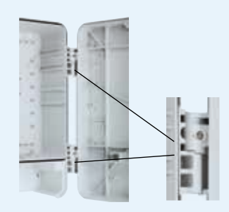
Hinge stop at 105°