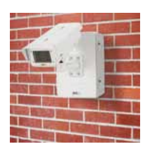
AXIS T98A16-VE Surveillance Cabinet