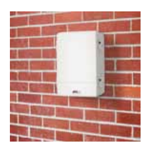
AXIS T98A15-VE Surveillance Cabinet