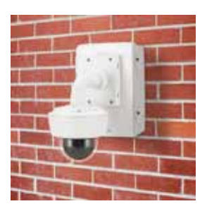
AXIS T98A18-VE Surveillance Cabinet