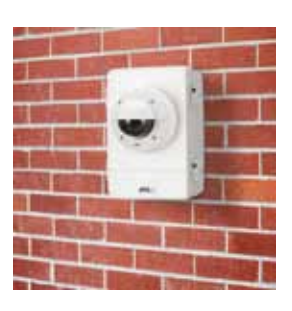
AXIS T98A17-VE Surveillance Cabinet